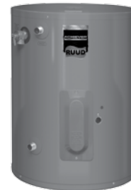
6, 10, 15, 19.9 and 30-Gallon